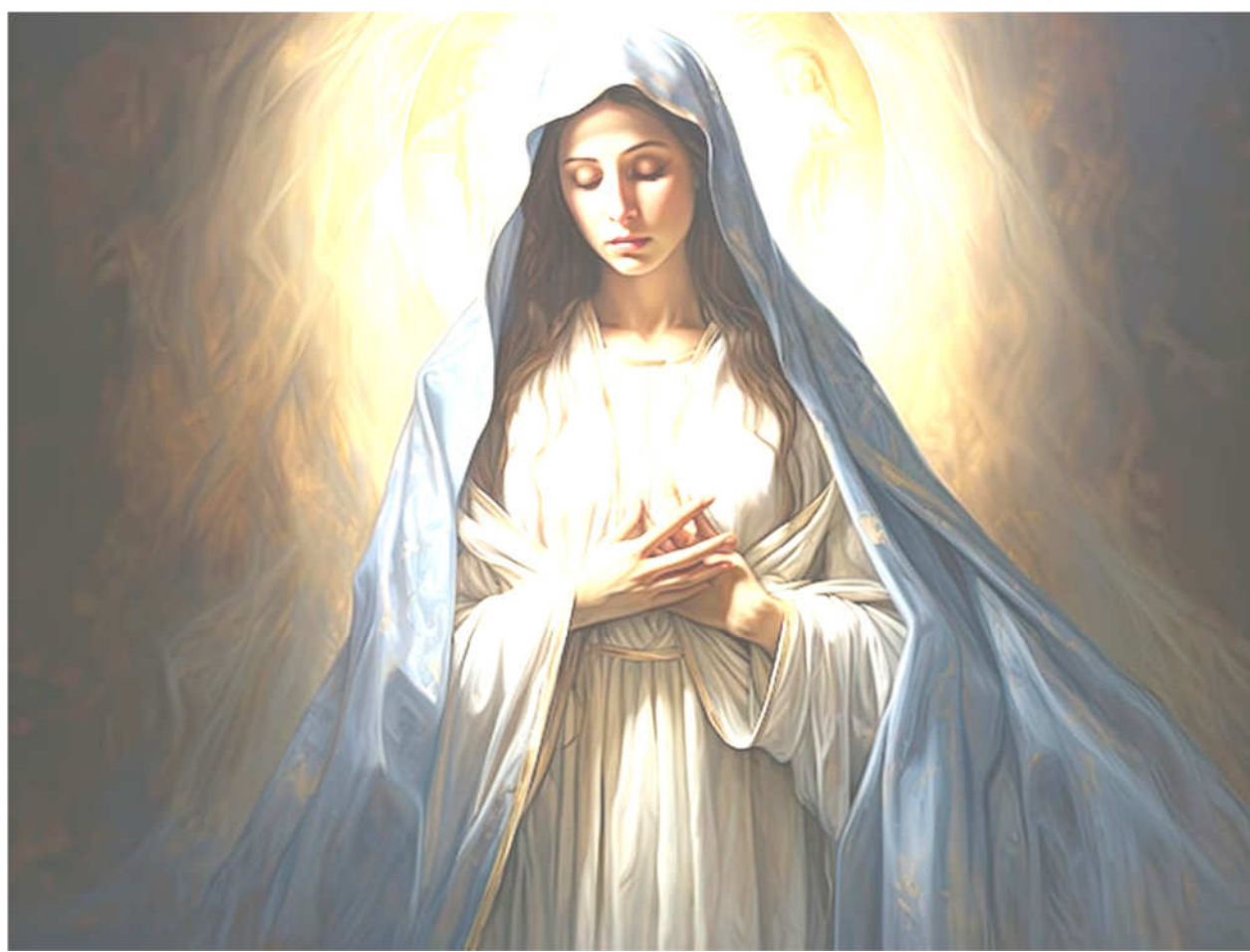
Blessed Virgin Mary, Mother of God, Mother of All

Children's Liturgy during the festive period. Sunday 31st December - No Children's Liturgy session Sunday 7th January (Epiphany) - Children's Liturgy sessions resume at the 9.15am Mass.