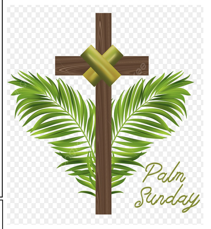
There will be watching at the Altar of Repose on Maundy Thursday until 10.00pm.